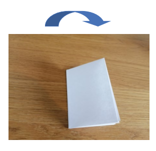
Fold it in half again and make sure all the edges are crisp.