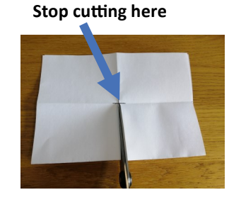
With the folded part of the paper facing you, use scissors to cut into the middle. Stop when you get to where all the folds meet to make a cross.