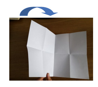
Fold it in half along the short middle crease and turn your paper so the fold is facing you.