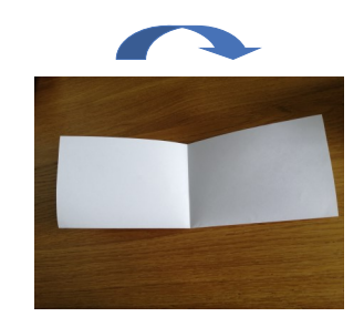
Fold it in half.