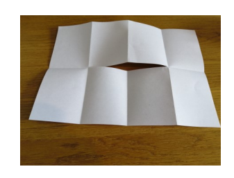
Unfold the paper again. You should have a hole in the middle that looks like this.